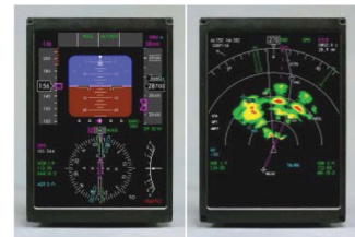
Primary Flight / Navigation Displays

Innovative Aerosystems provides multiple engine and fuel gauges for military and commercial applications. The SHP indicator provides indication of shaft horsepower at a constant 13,820 RPM. The Turbine Inlet Temperature Indicator provides an updated form, fit and function replacement for the earlier P-3 TIT Indicator made by Lockheed. It is compatible with military thermocouple standards and aircraft connectors. Our Fuel Quantity Indicator/Totalizer operates in any of the individual fuel quantity indicator (FQI) positions or the totalizer position. Pin jumpers in the mating connector direct operating mode, English (LB) or metric (KG) units of measure, and scaling.