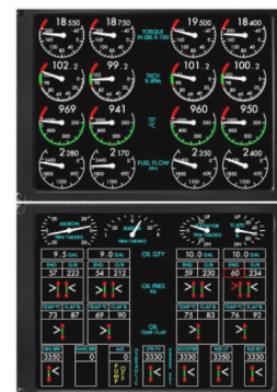
Flat Panel Engine Instrument Displays

Flat Panel Engine Instrument Display for low cost upgrade of the C-130 engine instrument cluster with a 75% reduction of LRUs.