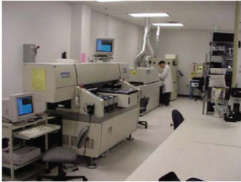
Innovative Aerosystems Surface Mount Facility

Our design and manufacturing campus in Exton, Pennsylvania houses all the disciplines and equipment needed to support the design, qualification, production and support requirements of our many programs.