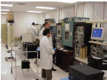
Final Acceptance and ESS Testing Facilities

Customer Service and Repair - Our ability to provide prompt and effective repair and upgrade service for our products after the sale is critical to our future growth. An AOG line is supported 24/7 and ensures timely resolution of our customers' service issues.