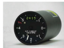
Shaft Horsepower Gauge

The RVSM compliant ASI operates in Normal or Standby mode. It displays IAS, ground speed (GS), true airspeed (TAS), Vmo, and angle of attack (AoA) data from the digital air data computer via ARINC 429