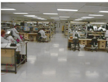
Class 100,000 Final Assembly Clean Room

Final Acceptance and ESS Test - All (100%) instruments are calibrated, subjected to Environmental Stress Screening (ESS) and Final Acceptance tested in this area. This room is equipped with a full complement of vibration equipment, ESS chambers, and custom and standard test equipment required to support production. WE also take advantage of combined environmental HALT/HASS Reliability Chambers.