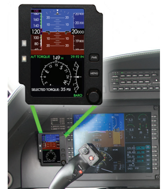
ThrustSense Installed on PC-12 NG

ThrustSense is an elegant solution that improves safety, performance, is high value, light weight, installs with minimum downtime and is a mature proven system.