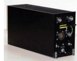
Digital Air Data Computer

The RVSM compliant altimeter functions in the self-sensing (Standby) or repeater (Normal) mode. It computes and displays ASN and the Hbc from pressure altitude data received from the digital air data computer via ARINC 429