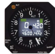
Air Data Display Unit

The RVSM compliant ADDU performs air data computation, input processing, data display, and alert functions enabling the system to display altitude, target altitude, and baro setting data; provide decision height and altitude alert indication; as well as compute and output altitude, airspeed, and alert flight control data. Signal processing is performed by an optional Analog Interface Unit (AIU) to interface with and support a wide range of autopilot/flight control, flight data recording, and alert equipment.