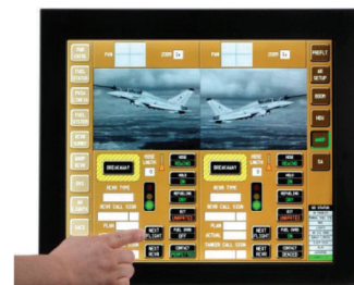
Aerial Refueling Mission Display

The Innovative Aerosystems Cockpit/IP® is an easily installed upgrade designed to replace existing EFIS, as well as the current pilot and copilot altimeter, airspeed, VSI, and RDMI gauges. Flat Panel Display Systems can add value and increase the operation life of legacy aircraft. IA Flat Panel Display Systems have received TSO and STC Approval